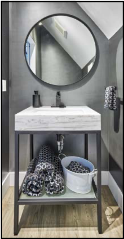
ABOVE: The master suite includes a powder room featuring a free-standing marble sink with black steel base and exposed plumbing pipes.