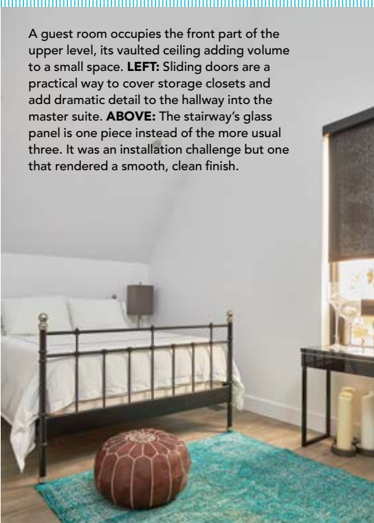
A guest room occupies the front part of the upper level, its vaulted ceiling adding volume to a small space. LEFT: Sliding doors are a practical way to cover storage closets and add dramatic detail to the hallway into the master suite. ABOVE: The stairway's glass panel is one piece instead of the more usual three. It was an installation challenge but one that rendered a smooth, clean finish.