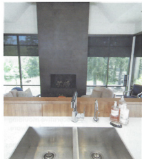
Below: A walnut partition provides visual separation between the kitchen's workspace and the adjoining great room.