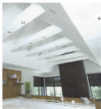
Above: A vaulted ceiling spans the kitchen and great room.